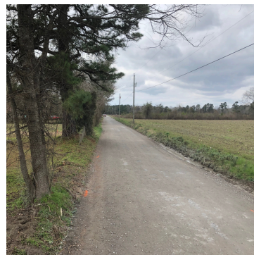
Fauling Rd - Before