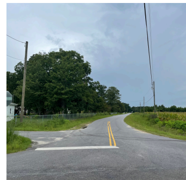
Fauling Rd - After