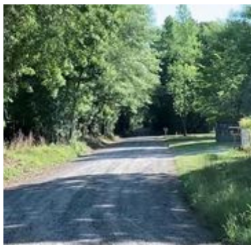
Upton Rd - Before