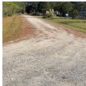
Waterpointe Ave - Before