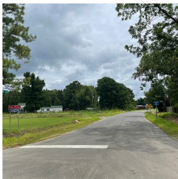
Ambassador Ave - After