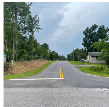
Beulah Tabernacle - After