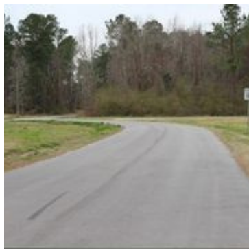
Greenleaf Rd - After