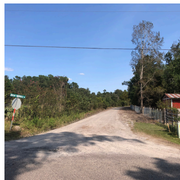
Beulah Tabernacle - Before