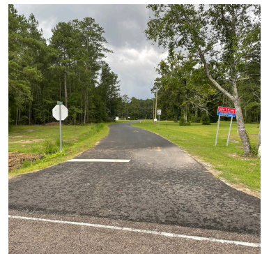
Steelshed Ln - Before