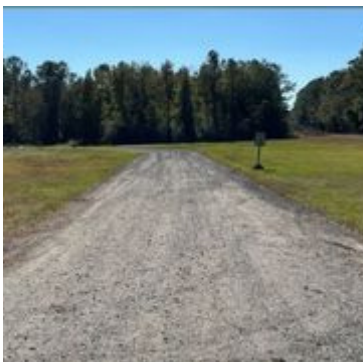
Greenleaf Rd - Before