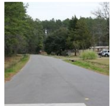
Waterpointe Ave - After