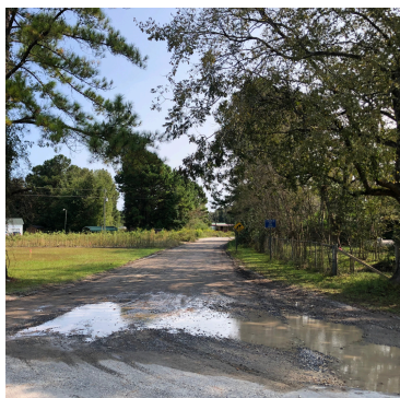
Ambassador Ave - Before