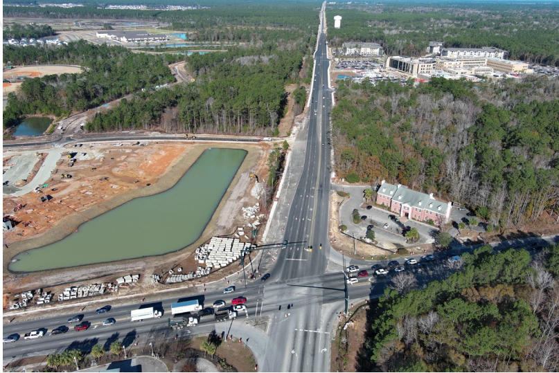
US 176 at US 17A