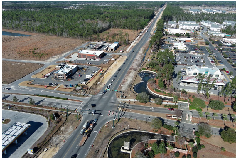
US 176 at Cane Bay Boulevard / North Creek Drive