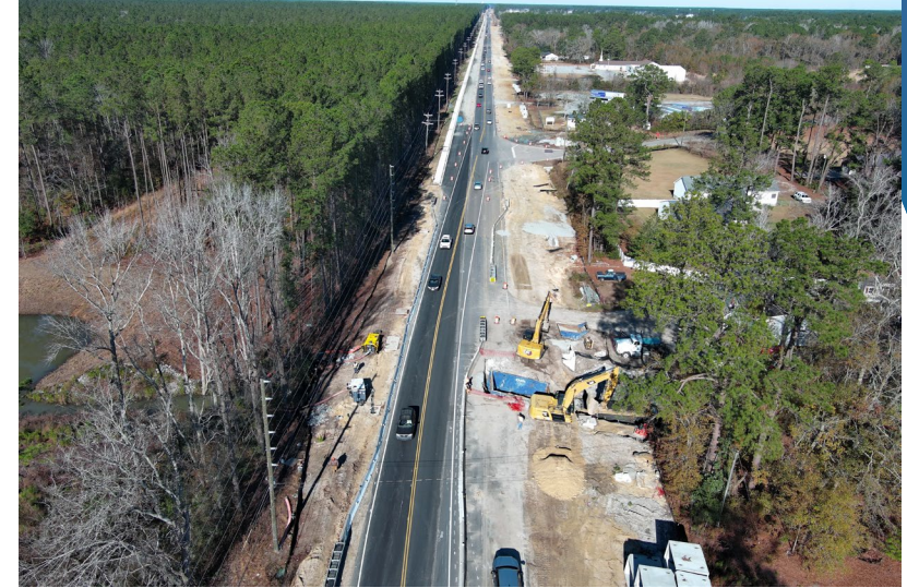
US 176 at Alexander Circle