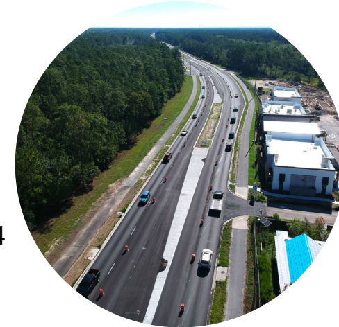
Clements Ferry Road Widening Phase 2