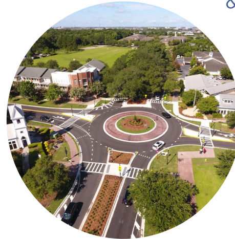
Daniel Island Drive at Seven Farms Drive