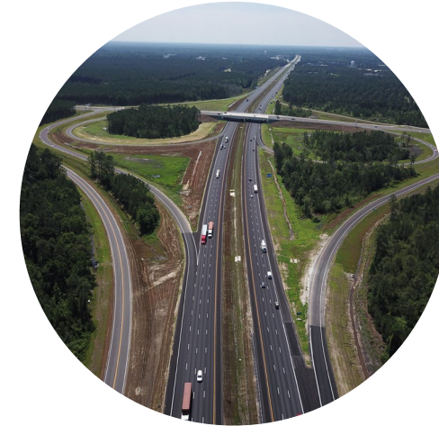
Sheep Island (Nexton) Parkway & I-26 Widening