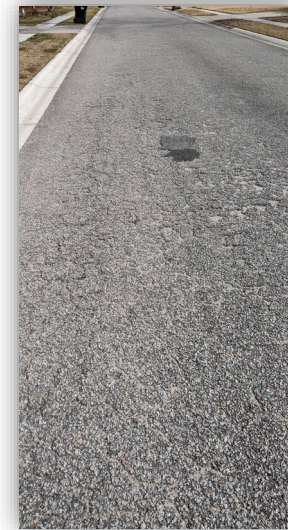
Eight Point Road