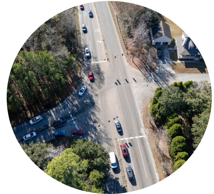
Snake Road at NAD Road