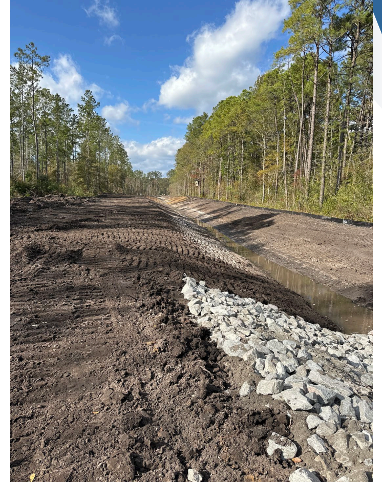
Pond 2 outfall ditch excavation completed