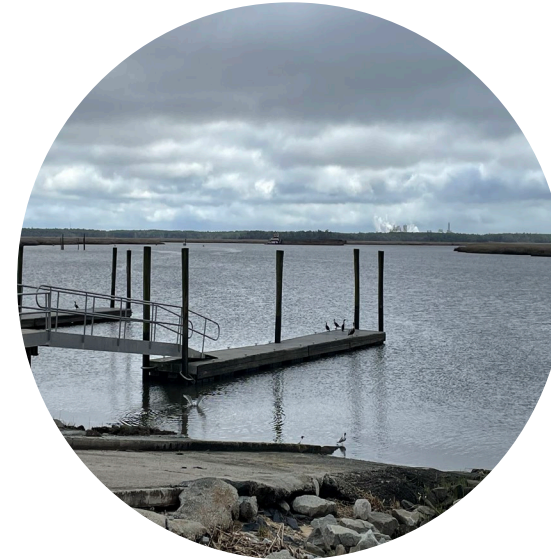
Bushy Park Channel Dredging