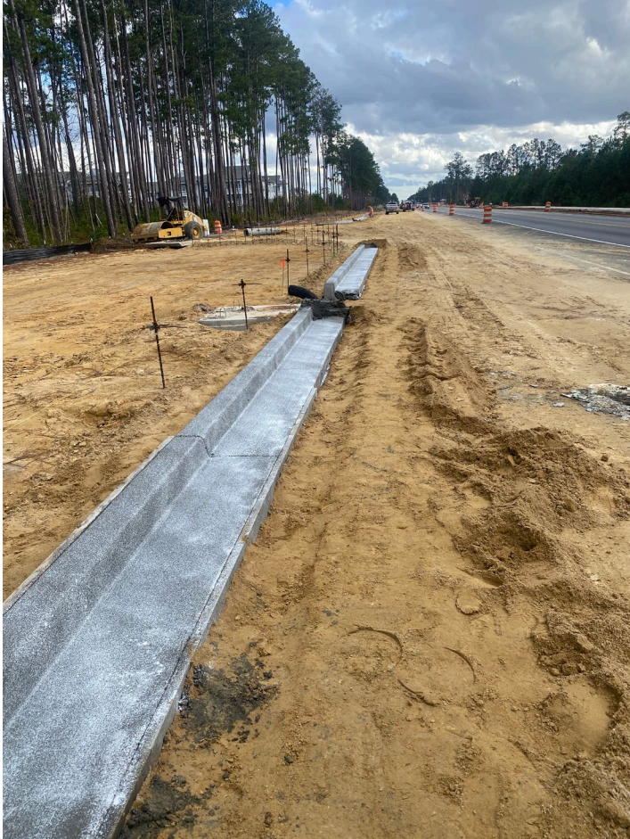
Road base preparation, stormwater drainage, curb & gutter and sidewalk construction continue