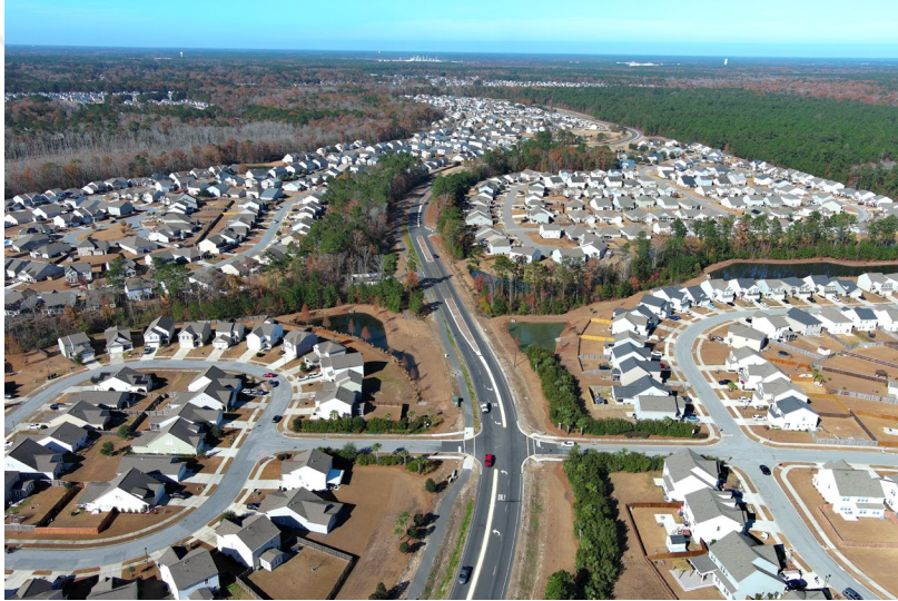
Henry Brown Boulevard at Chaste Tree Drive