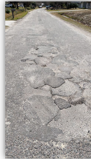
Tall Spruce Drive