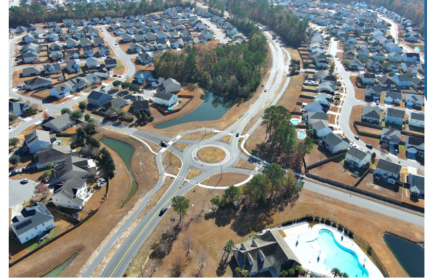
Henry Brown Boulevard at Adler Drive