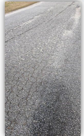
Long Needle Drive