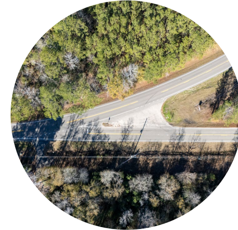
Cooper Store Road at Black Tom Road Extension