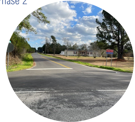
Old Parker Road