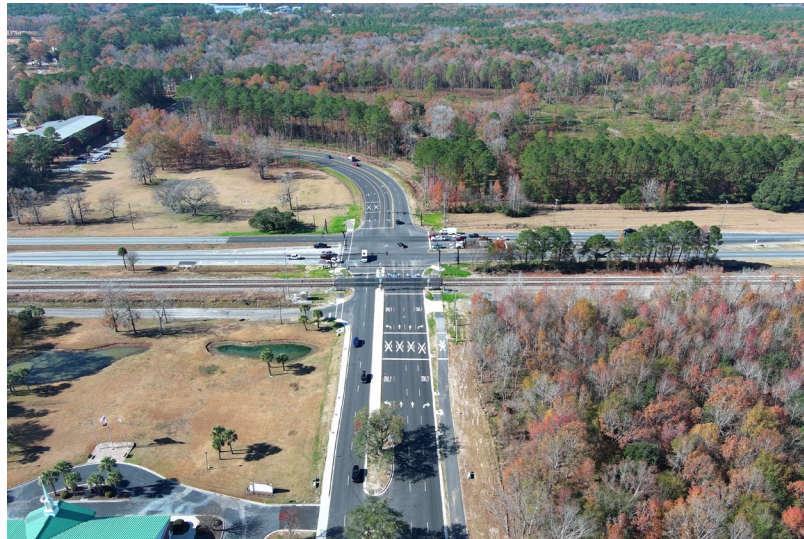
Old Mount Holly Road at US 52