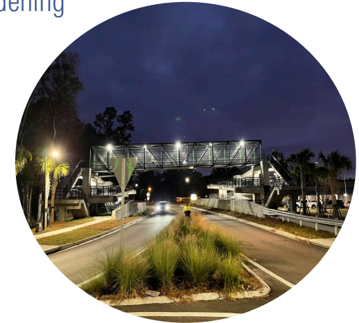
Royle Road at Sangaree Parkway